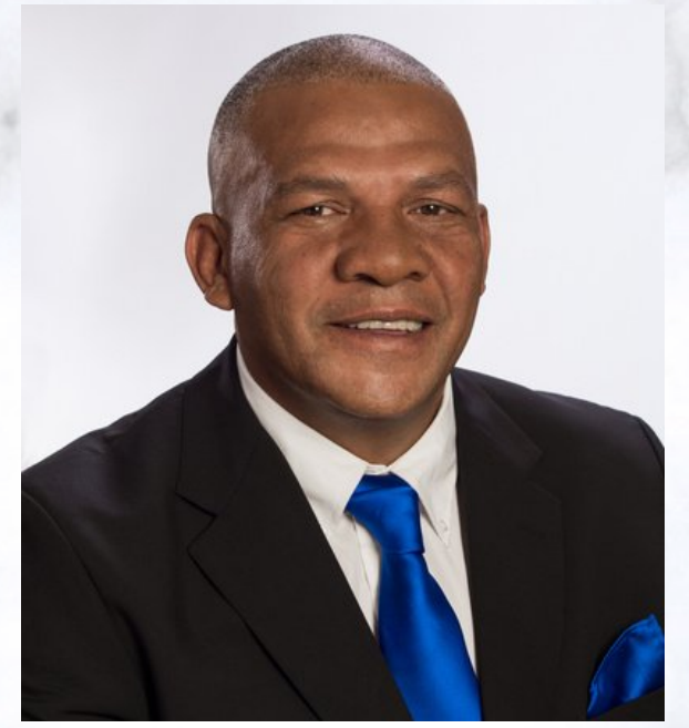
Cllr Vasco Da Gama (Speaker of Council)