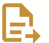
Submit Online Comments