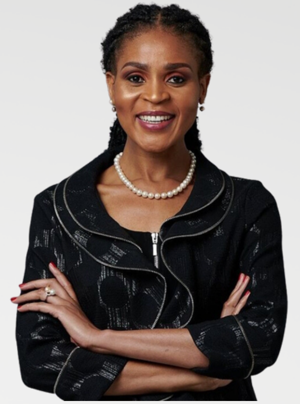
Cllr Colleen Makhubele (Speaker of Council)

REQUEST FOR PUBLIC COMMENTS ON THE 2023/ 24 DRAFT 5 YEAR INTEGRATED DEVELOPMENT PLAN (IDP) MEDIUM TERM BUDGET AND DRAFT RATES & TARIFFS