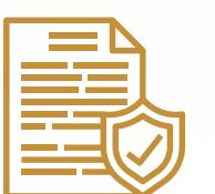
Draft Rates & Tariffs Policy