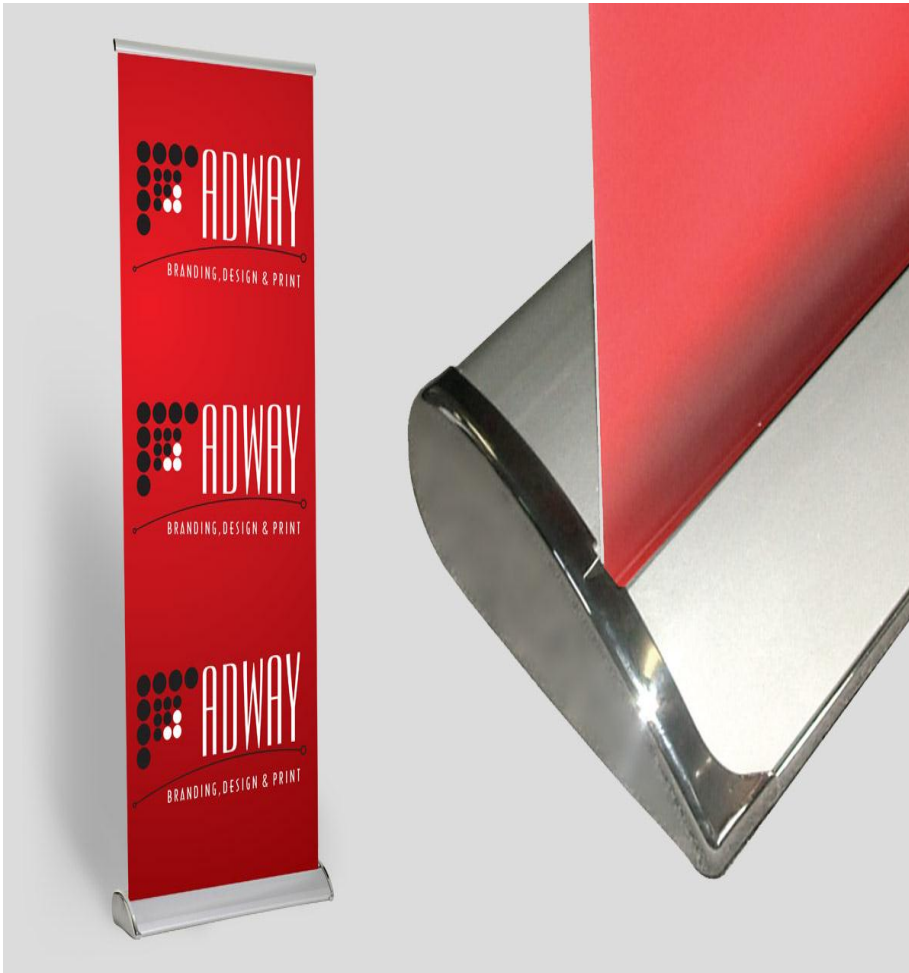
Pull up banners