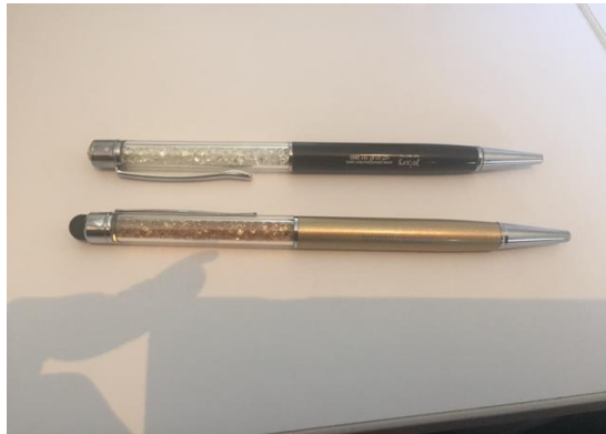
Sample of the pens