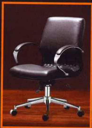
B03 LEA VI TOR'S IA