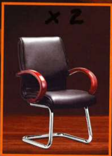
B0 M AC LEATH HA Features: gen leath pper